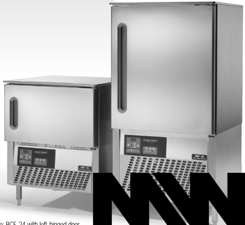
Above: BCF-24 with left-hinged door Right: BCF-65 with left-hinged door