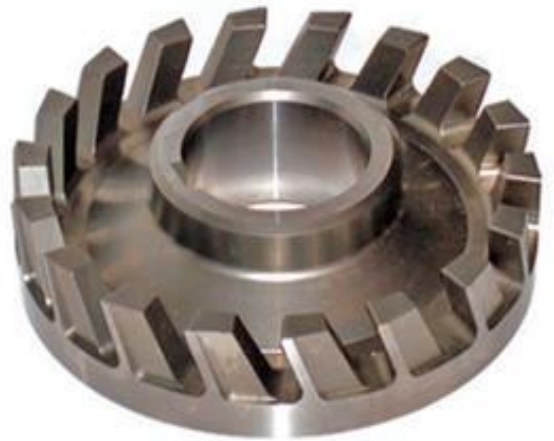
Inner Ring Knife