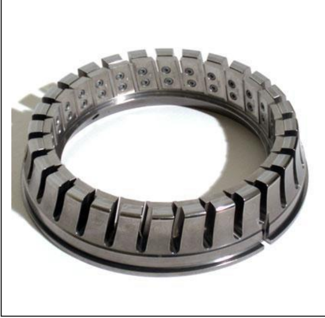
Outer Ring Knife