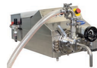
(Below) With pipe feed attached, for liquid fills.