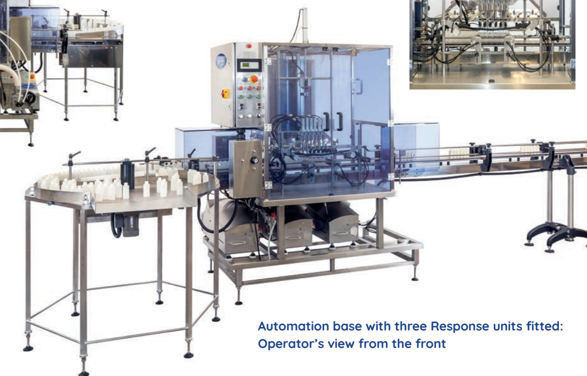
Automation base with three Response units fitted: Operator's view from the front