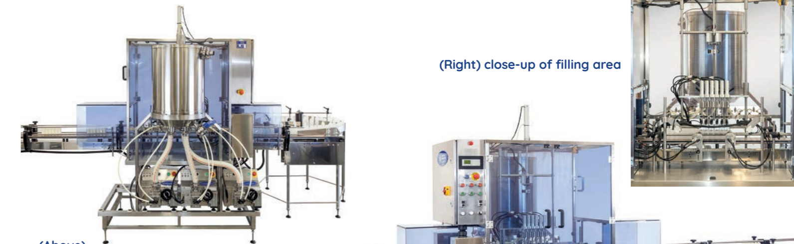
(Above) Automation System with three Response units fitted, seen from the rear