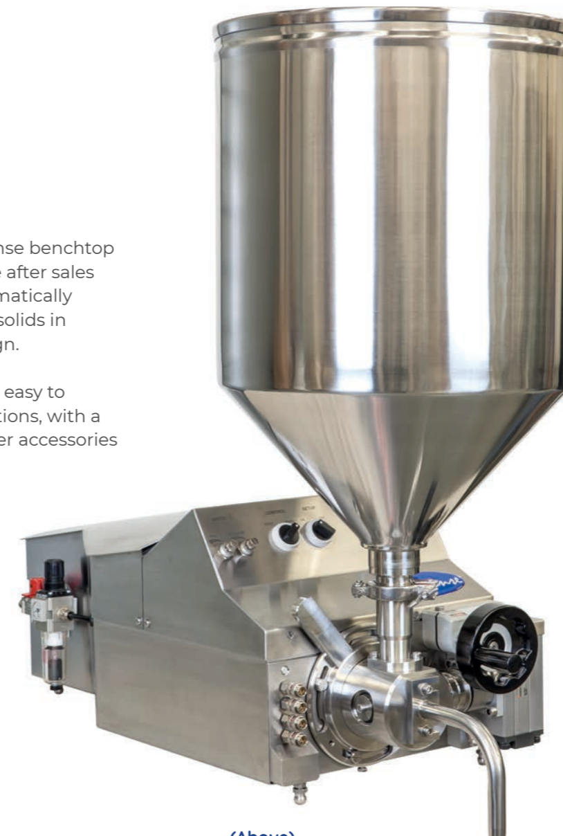
(Above) With standard hopper for filling creams, pastes, and solids in suspension