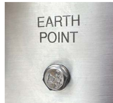
The Earth Point