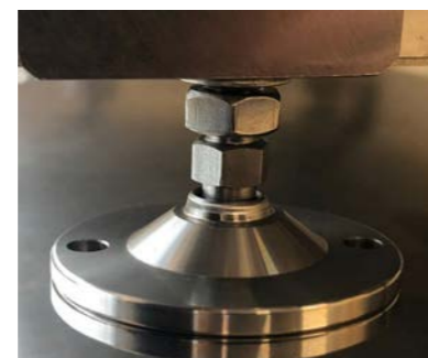
ATEX compliant feet