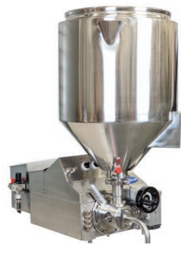
(Left) A heated hopper for hot fills.

These machines are ideally suited to those wanting to start automating a previously manual filling process, and those that don't currently require the output levels offered by a fully automated solution. However, once production demands increase, Response units can be mounted onto an Automation Base to create an extremely flexible fully automatic filling machine.